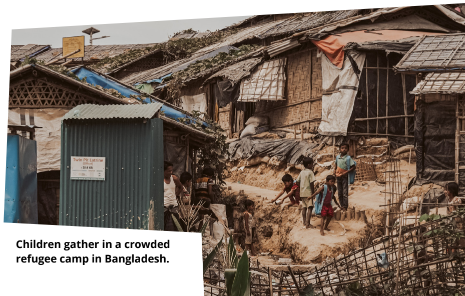
Children gather in a crowded refugee camp in Bangladesh.

(Hold your thumb as you pray for the most vulnerable, those closest to God's heart, or simply sit in silence before God. Hold the silence together.)