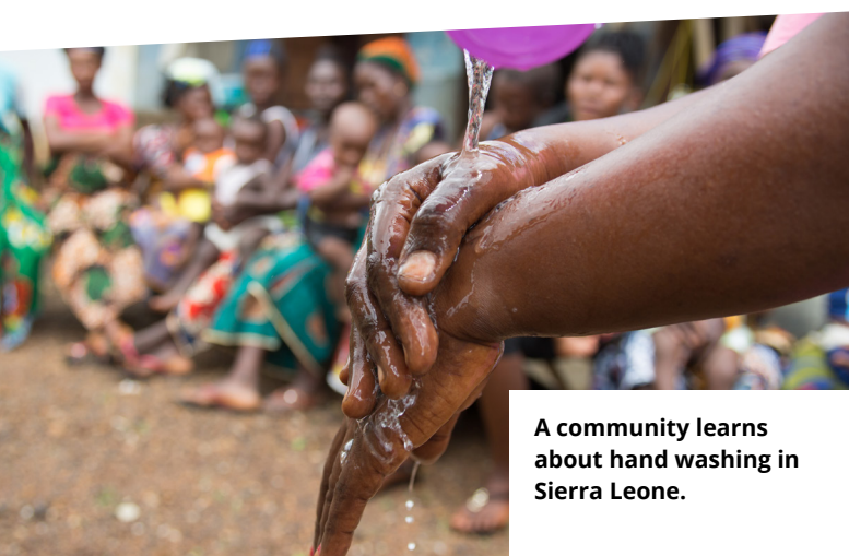
A community learns about hand washing in Sierra Leone.

Hand washing in Scripture is closely associated with innocence and cleansing from sin. (See Exodus 30:17-21, Psalm 26:6, Job 9:30, Matthew 27:24, James 4:8 to mention a few.)