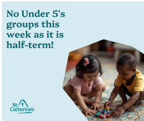
An example of the new branding