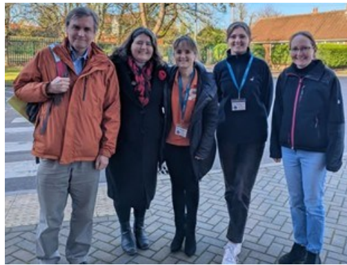
The team after a RE Lesson at Little Heath